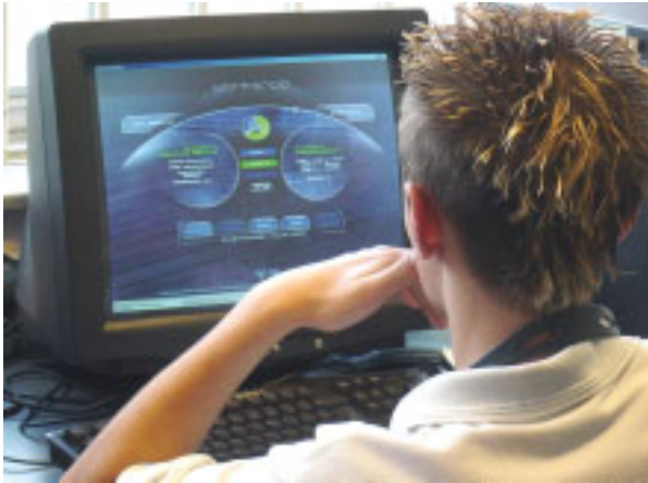
Racing Academy trials